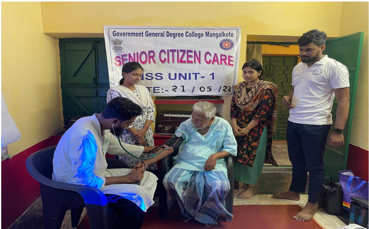
The volunteers conducting health check-up