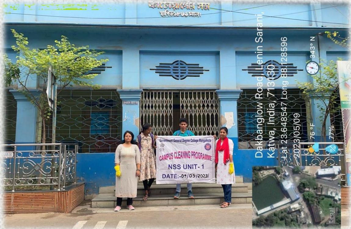
NSS volunteers at the end of the campus cleaning drive at Katwa Municipality