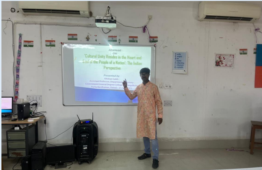
PIC.1: THE SPEAKER WITH HIS PRESENTATION