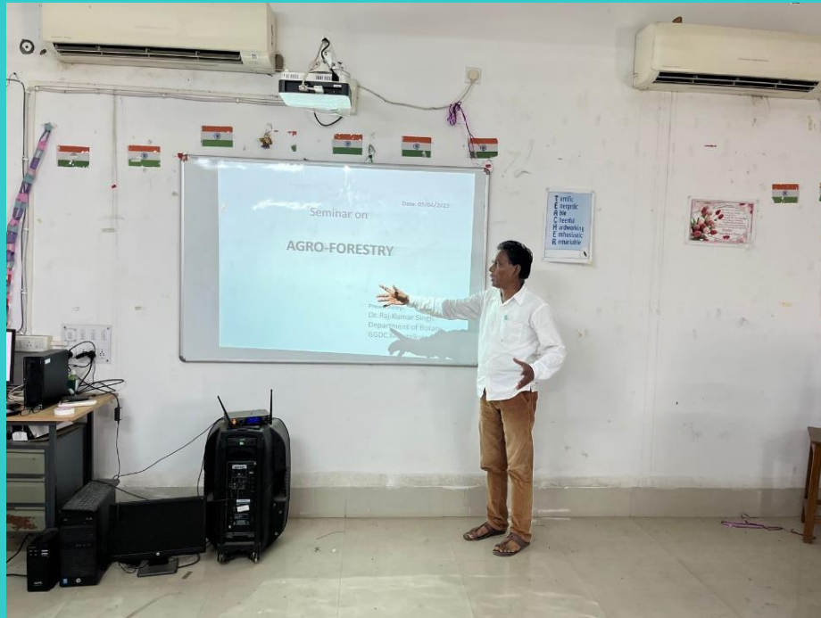
PIC.1: THE SPEAKER WITH HIS PRESENTATION