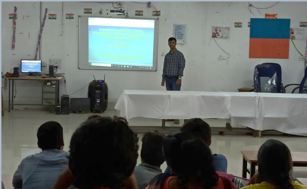
PIC.2: THE SPEAKER DELIVERING HIS LECTURE