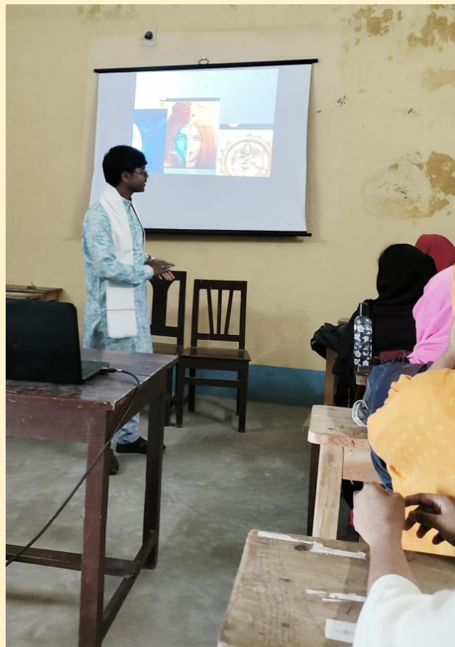
PIC.: THE SPEAKER DELIVERING HIS LECTURE