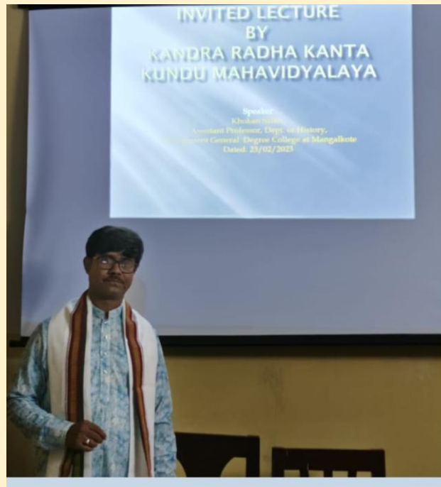
PIC.: THE SPEAKER WITH HIS PRESENTATION