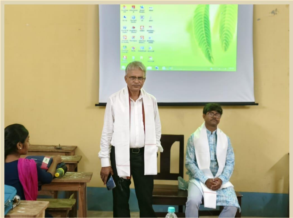
PIC.: THE SPEAKER WITH THE FACULTY MEMBER OF KANDRA COLLEGE