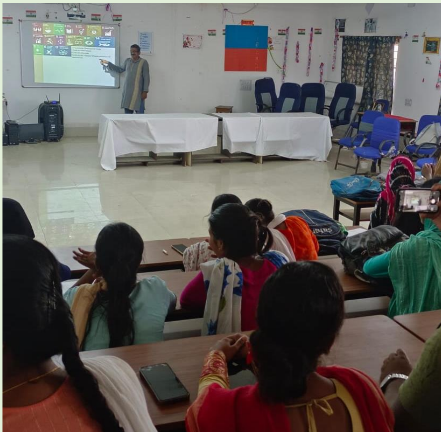
PIC.2: THE SPEAKER IN ACTION