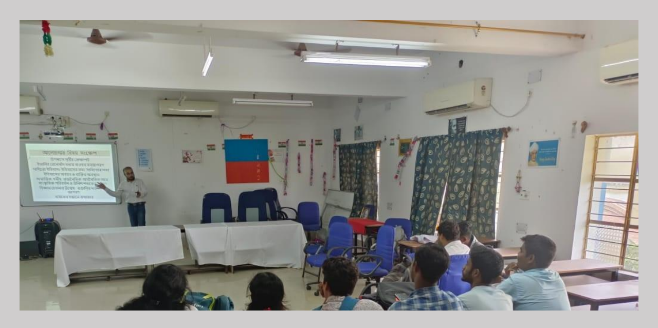
PIC.2: THE SPEAKER DELIVERING HIS LECTURE