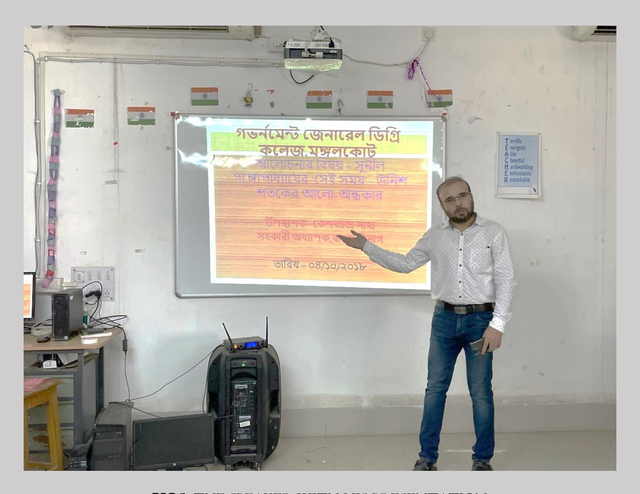
PIC.I: THE SPEAKER WITH HIS PRESENTATION