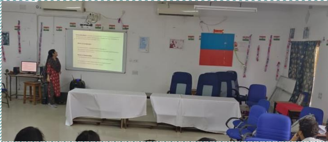
PIC.1: THE SPEAKER WITH HER PRESENTATION