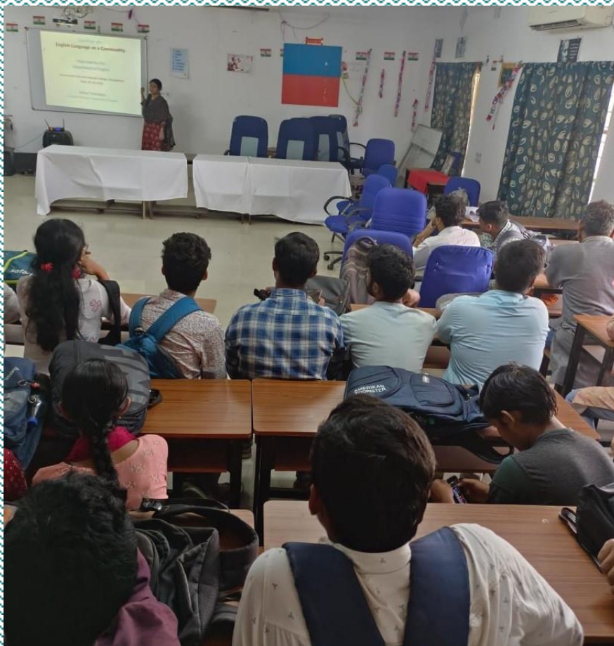
PIC.2: THE SPEAKER IN ACTION