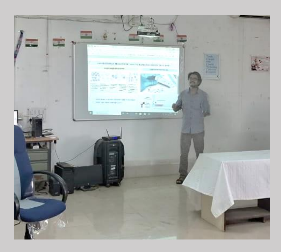
PIC.1: THE SPEAKER WITH HIS PRESENTATION