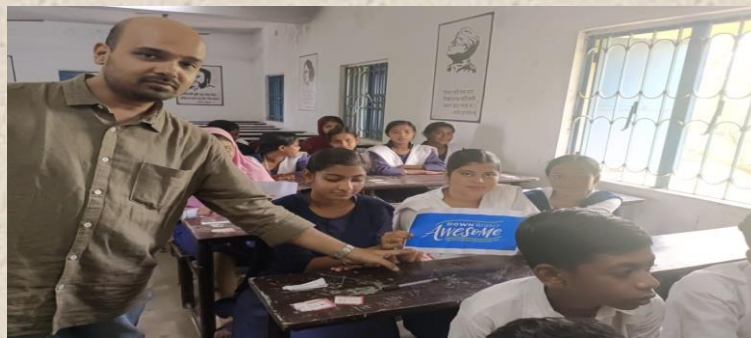
Student volunteers and teachers from the Department of Sociology distributing pamphlets among school students to raise awareness about Down Syndrome.