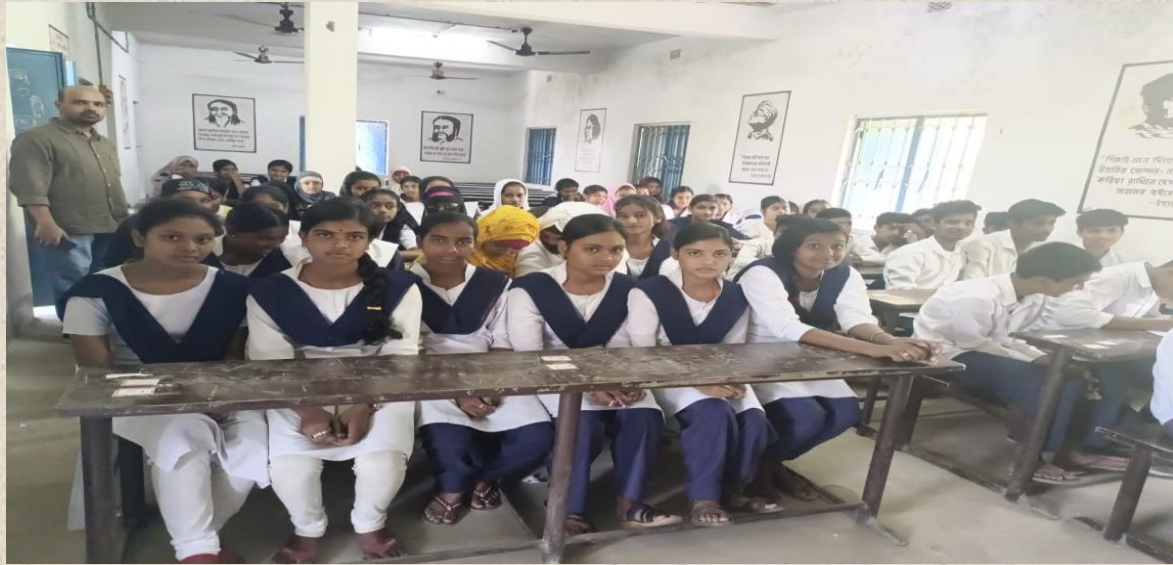
Student participants from Palishgram High School