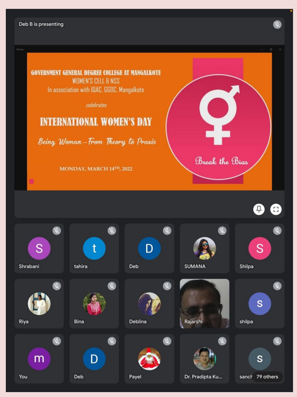
Delivering his lecture