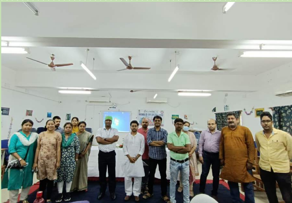
FIG. 4: THE SPEAKER WITH THE FACULTY MEMBERS