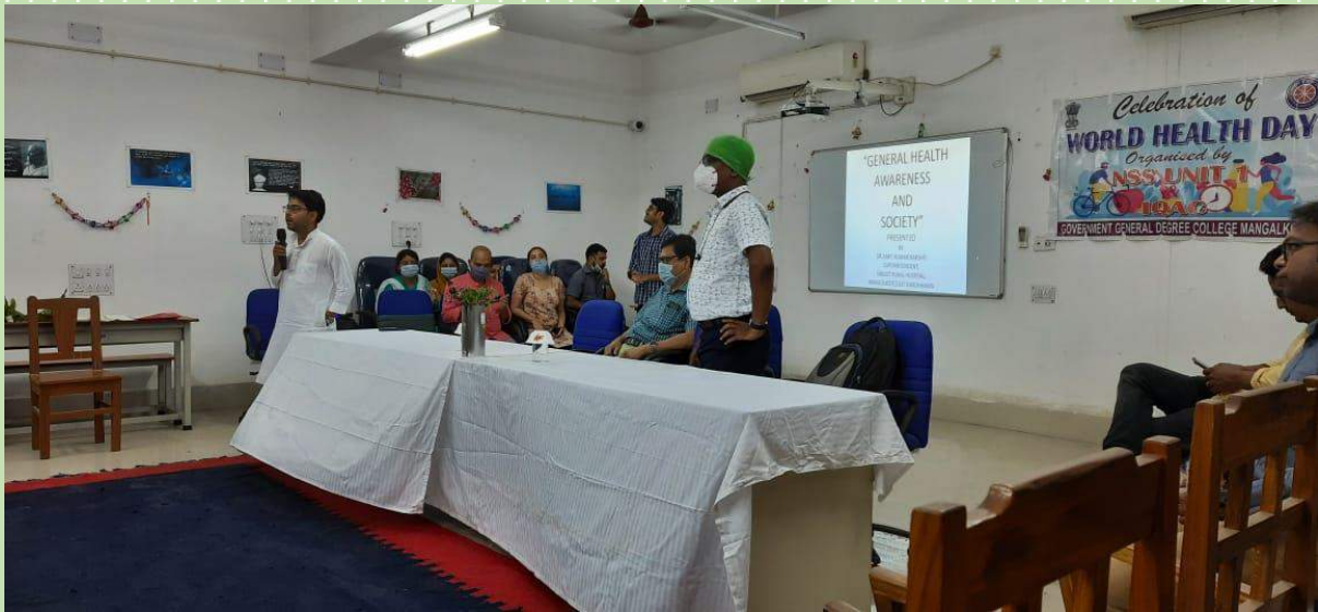
FIG 1: PROGRAM OFFICER, NSS INTRODUCING THE SPEAKER