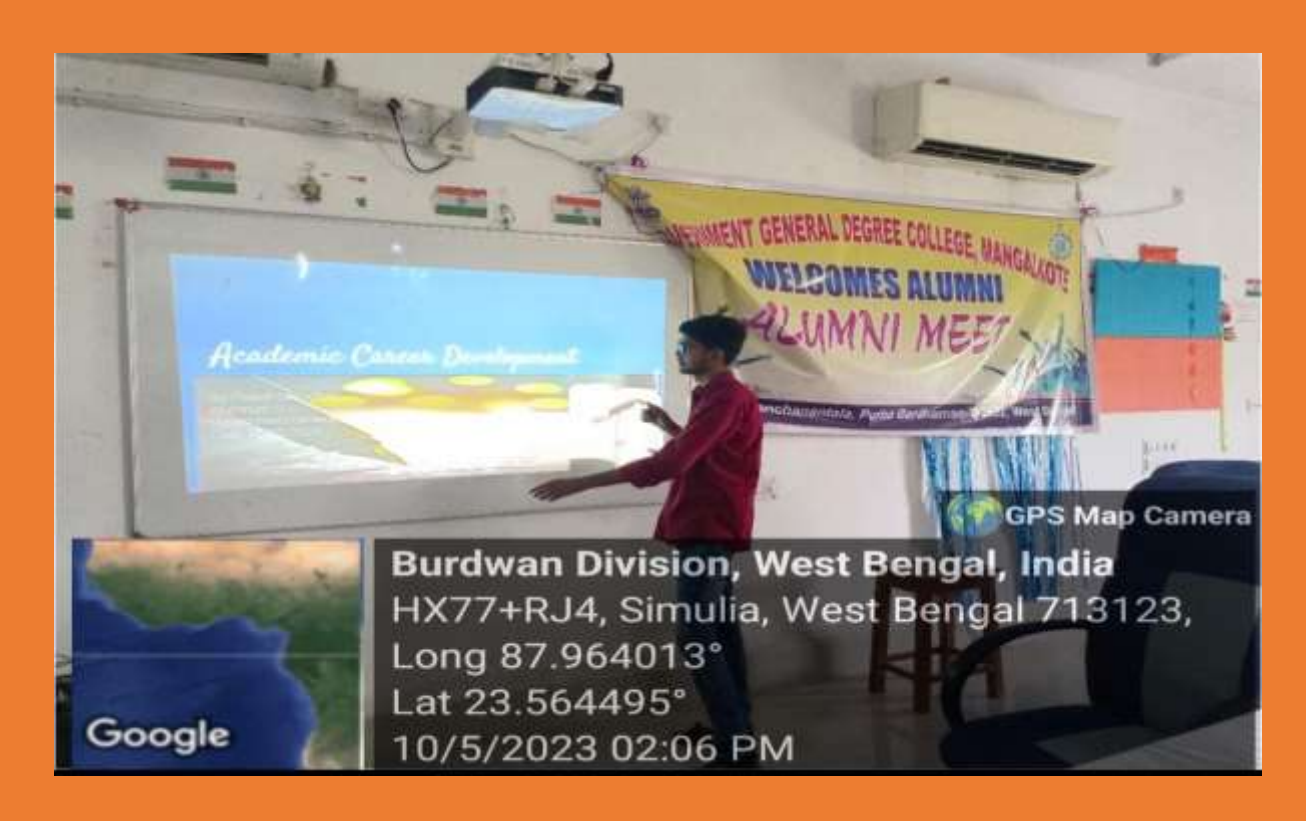
An Alumnus Presenting a Power-Point Presentation