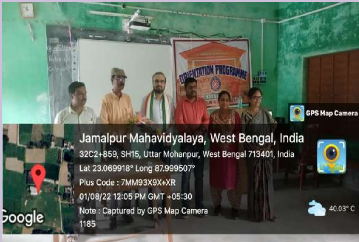
PIC.3. THE SPEAKER WITH FACULTY MEMBERS OF JAMALPUR MAHAVIDYALAYA