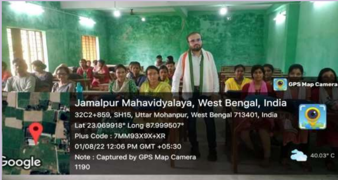
PIC.1: THE SPEAKER WITH STUDENTS OF JAMALPUR MAHAVIDYALAYA