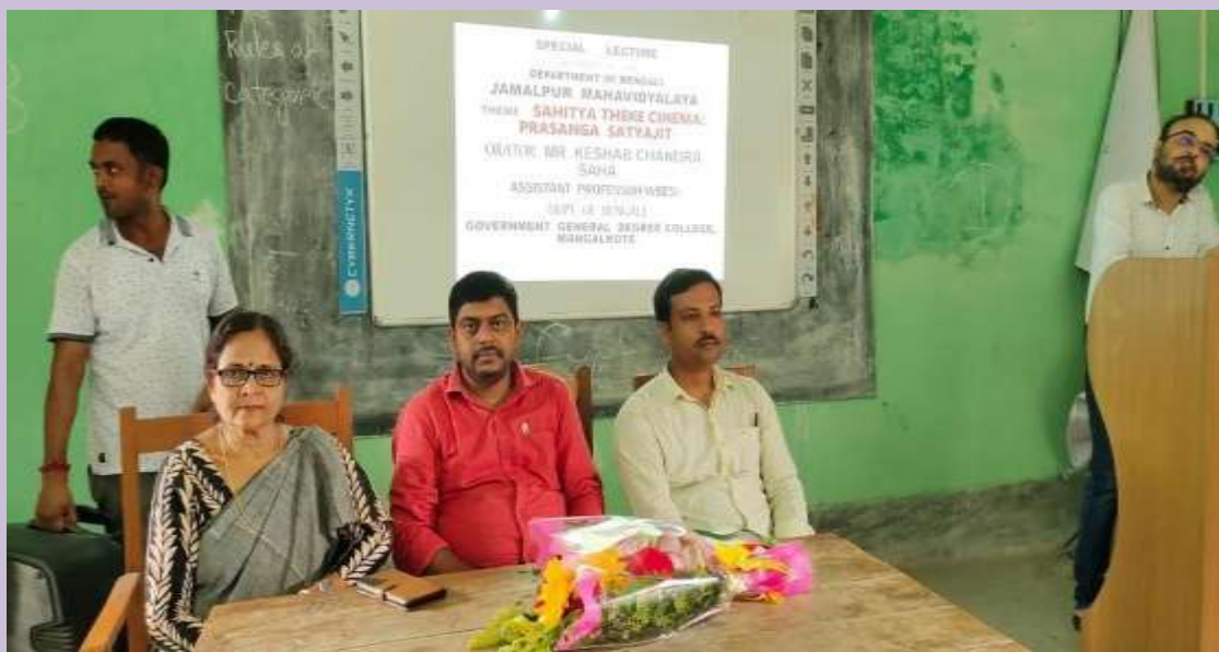
PIC.2: THE SPEAKER DELIVERING HIS LECTURE