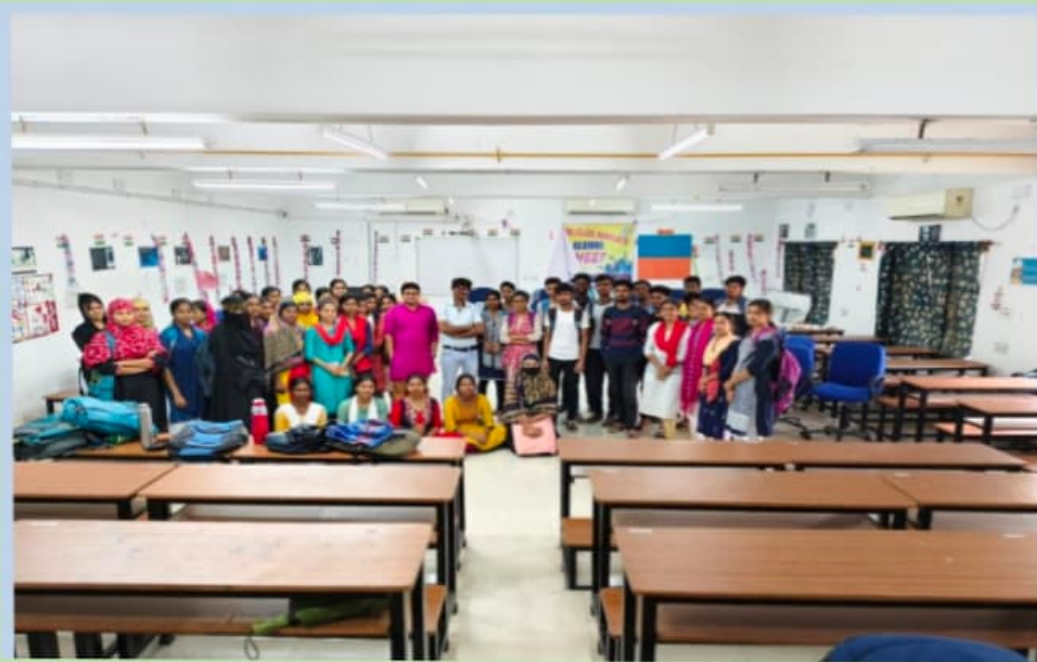
Students of GGDC, Mangalkote with the speaker