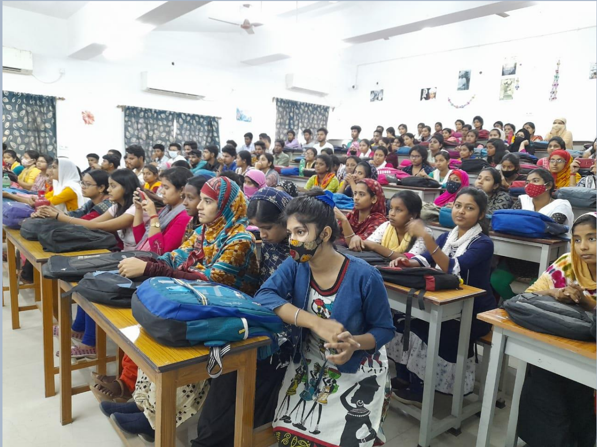
FIG. 5: THE STUDENT PARTICIPANTS OF THE PROGRAMME