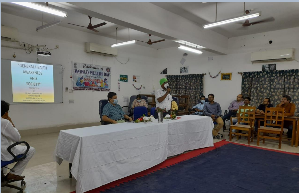
FIG. 2: THE SPEAKER GIVING HIS INTRODUCTORY SPEECH