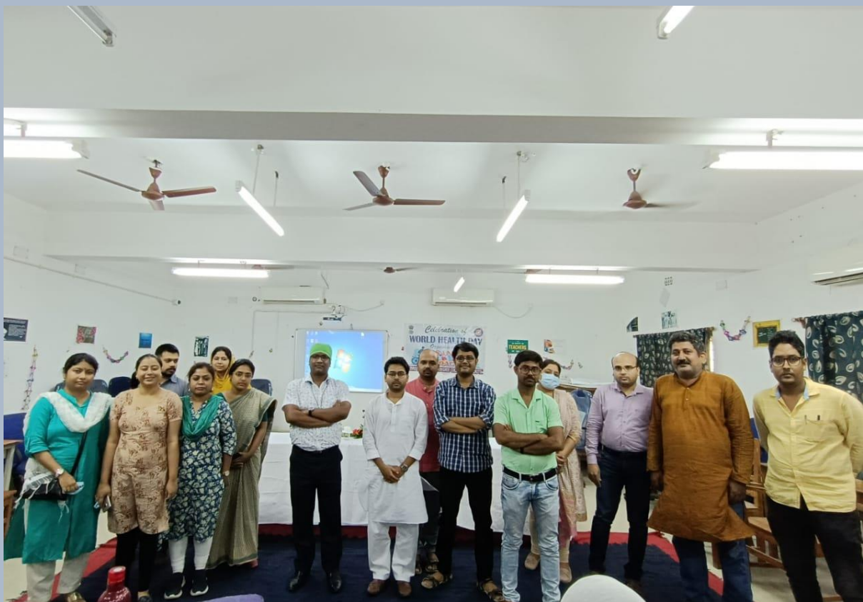
FIG. 4: THE SPEAKER WITH THE FACULTY MEMBERS