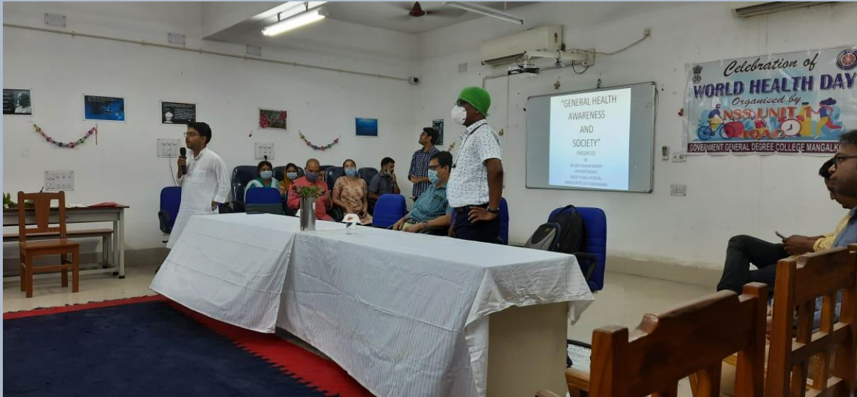
FIG 1: PROGRAM OFFICER, NSS INTRODUCING THE SPEAKER