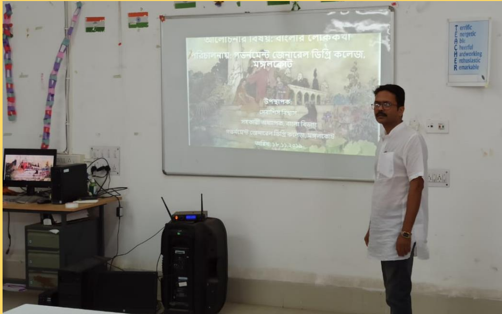
PIC.1: THE SPEAKER WITH HIS PRESENTATION