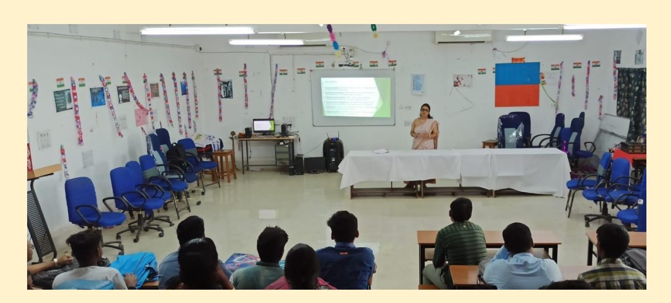
PIC.2: THE SPEAKER DELIVERING HER LECTURE