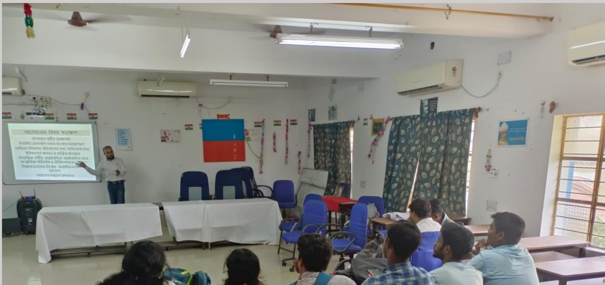
PIC.2: THE SPEAKER DELIVERING HIS LECTURE ON 04.10.18