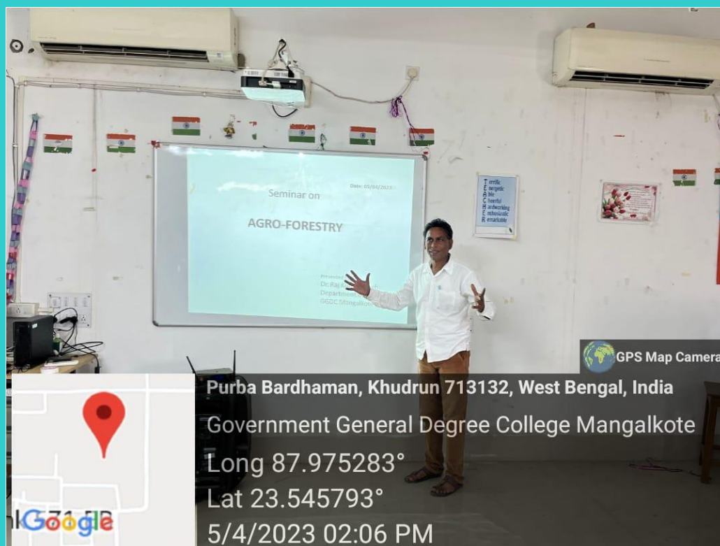
PIC.1: THE SPEAKER WITH HIS PRESENTATION ON 05.04.23