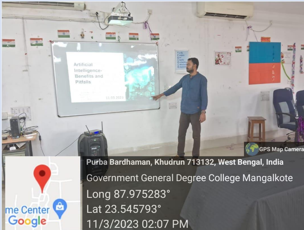
PIC.1: THE SPEAKER WITH HIS PRESENTATION ON 11.03.23