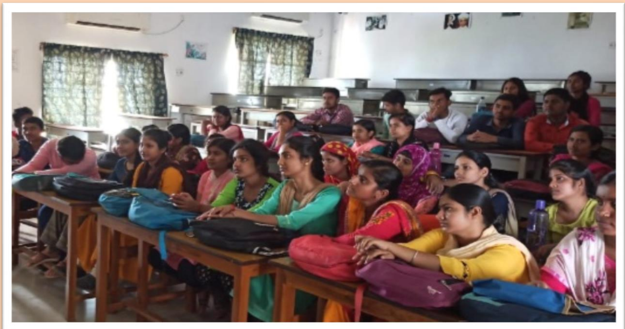
Our students during the seminar on the occasion of Swami Vivekandanda's Birthday