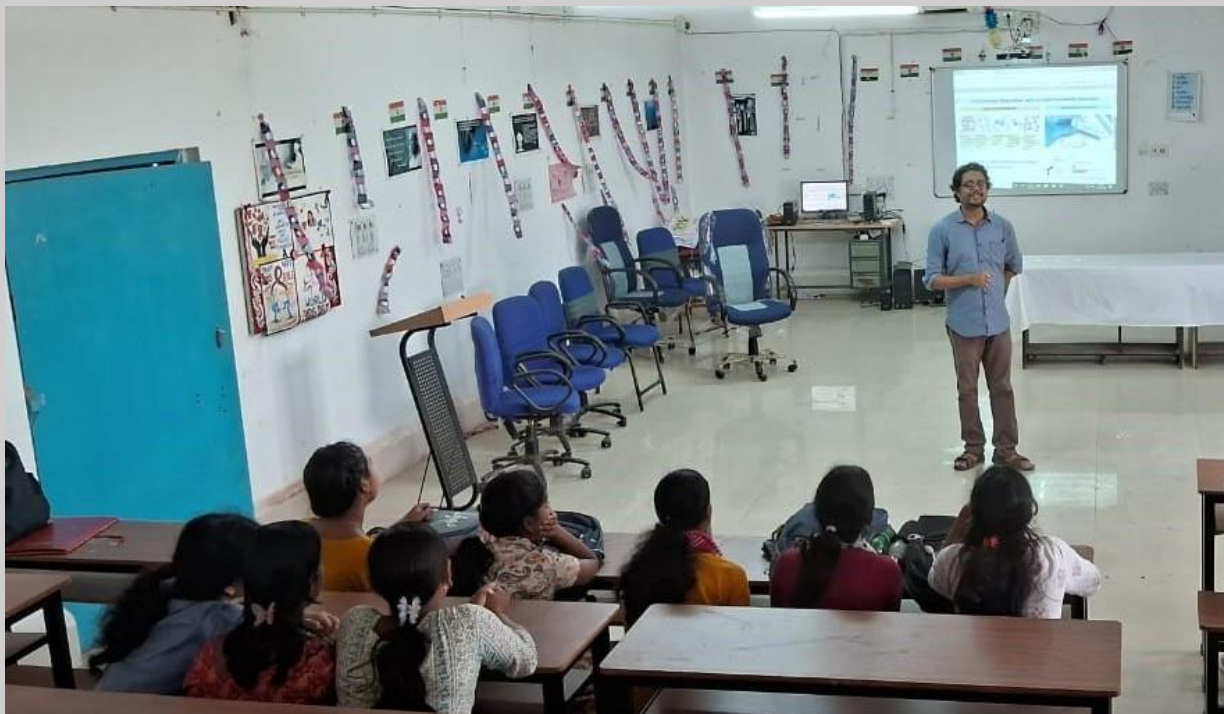
PIC.2: THE SPEAKER IN ACTION ON 16.02.19