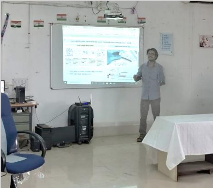
PIC.1: THE SPEAKER WITH HIS PRESENTATION ON 16.02.19