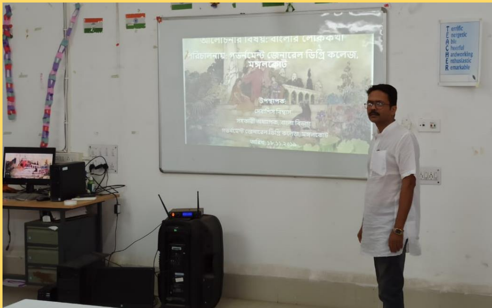
PIC.1: THE SPEAKER WITH HIS PRESENTATION ON 18.11.19