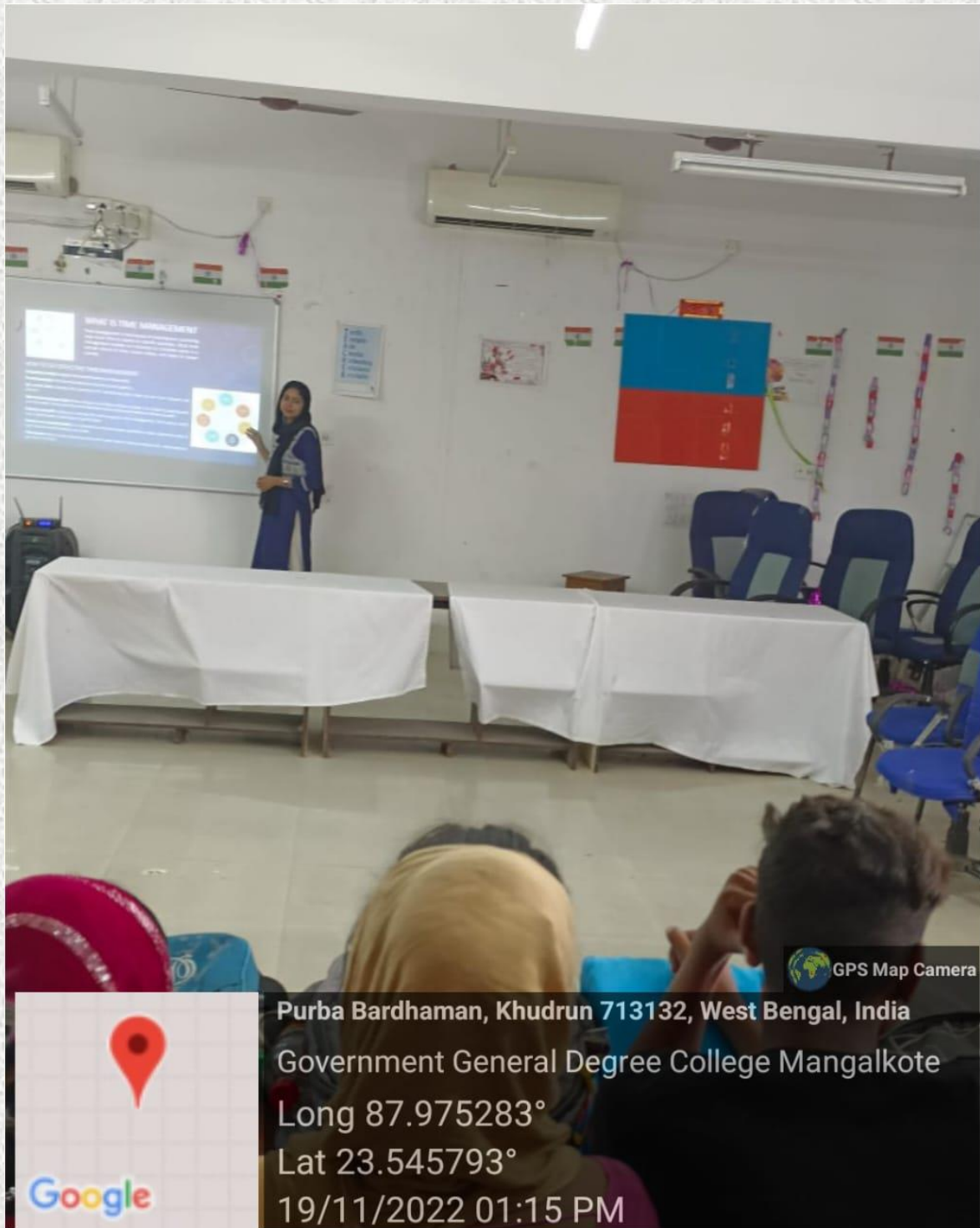
PIC.2: THE SPEAKER DELIVERING HER LECTURE ON 19.11.22