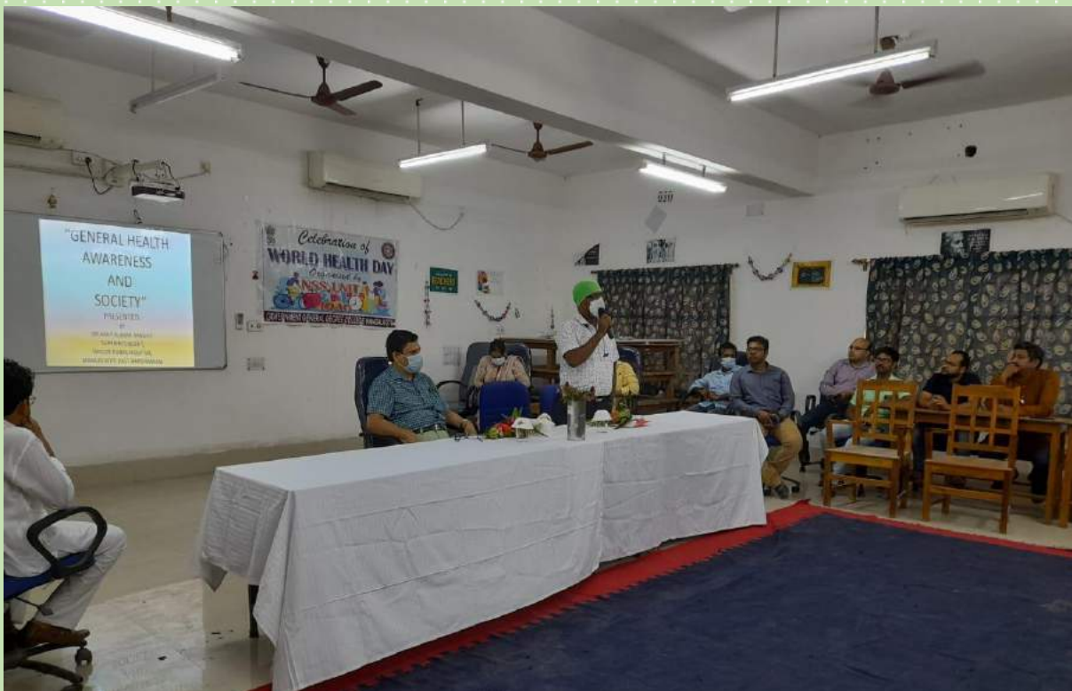
FIG. 2: THE SPEAKER GIVING HIS INTRODUCTORY SPEECH