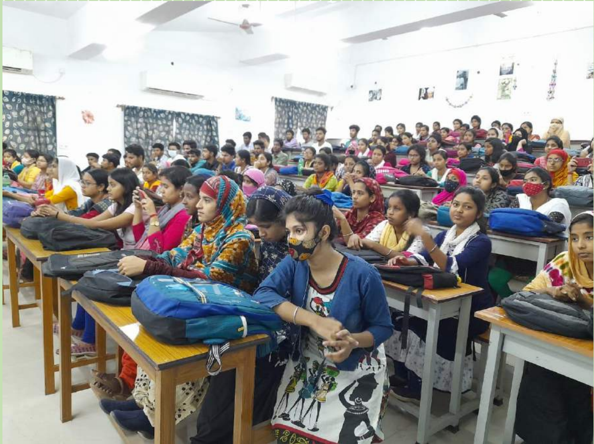
FIG. 5: THE STUDENT PARTICIPANTS OF THE PROGRAMME