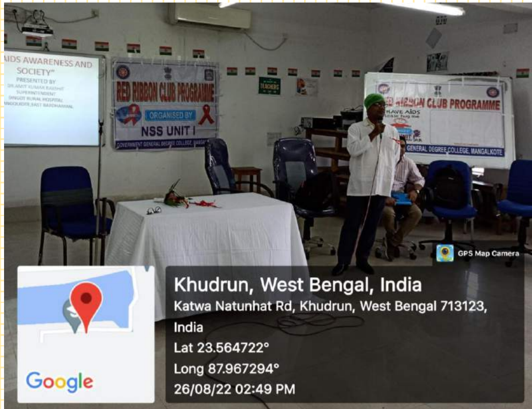
FIG. 2: THE SPEAKER DELIVERING HIS LECTURE