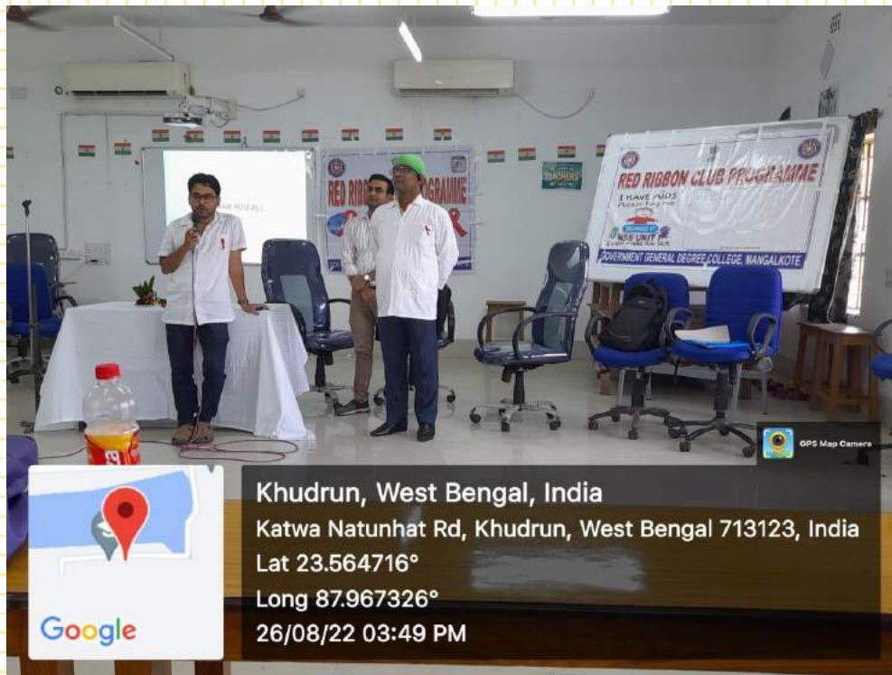
FIG 1: PROGRAM OFFICER, NSS INTRODUCING THE SPEAKER DATE: 26.08.22