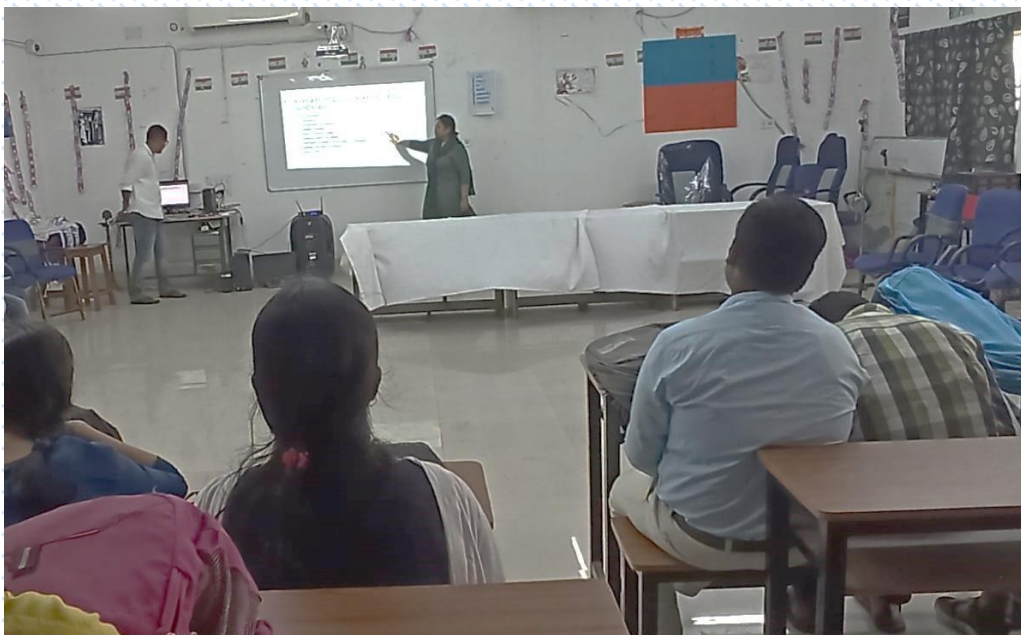
PIC.2: THE SPEAKER DELIVERING HER LECTURE ON 29.06.18