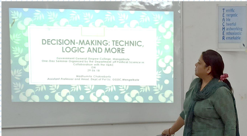
PIC.1: THE SPEAKER WITH HER PRESENTATION ON 29.06.18