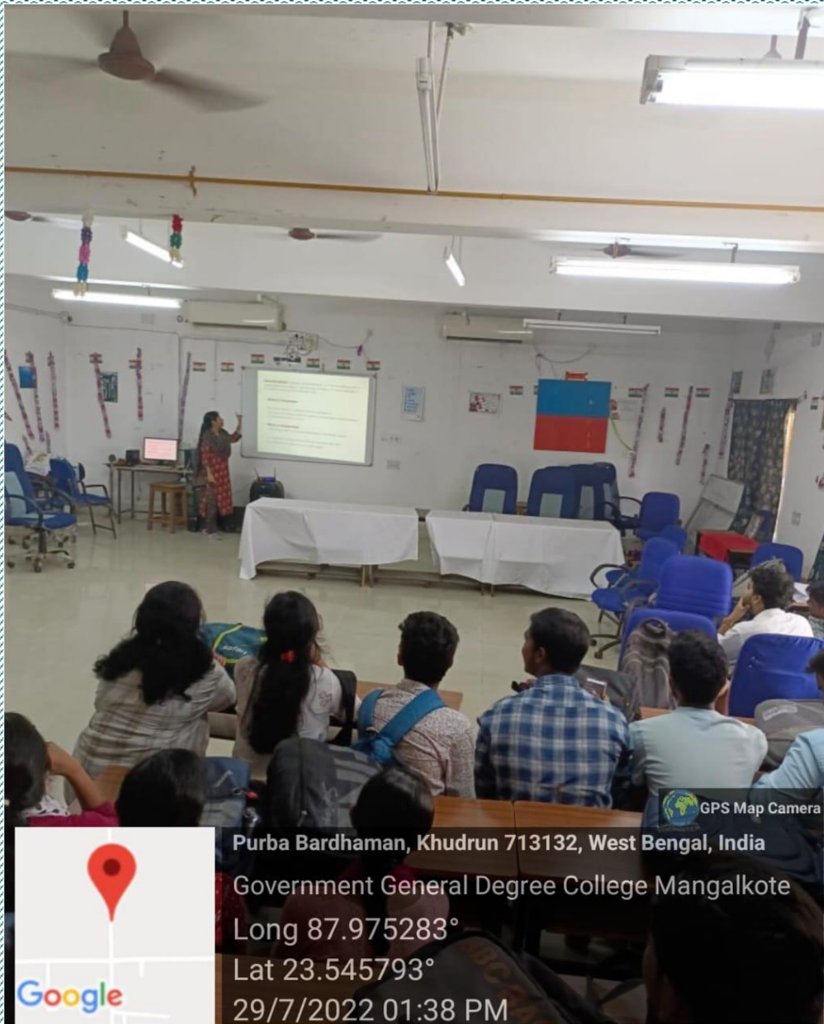
PIC.1: THE SPEAKER WITH HER PRESENTATION ON 29.07.22