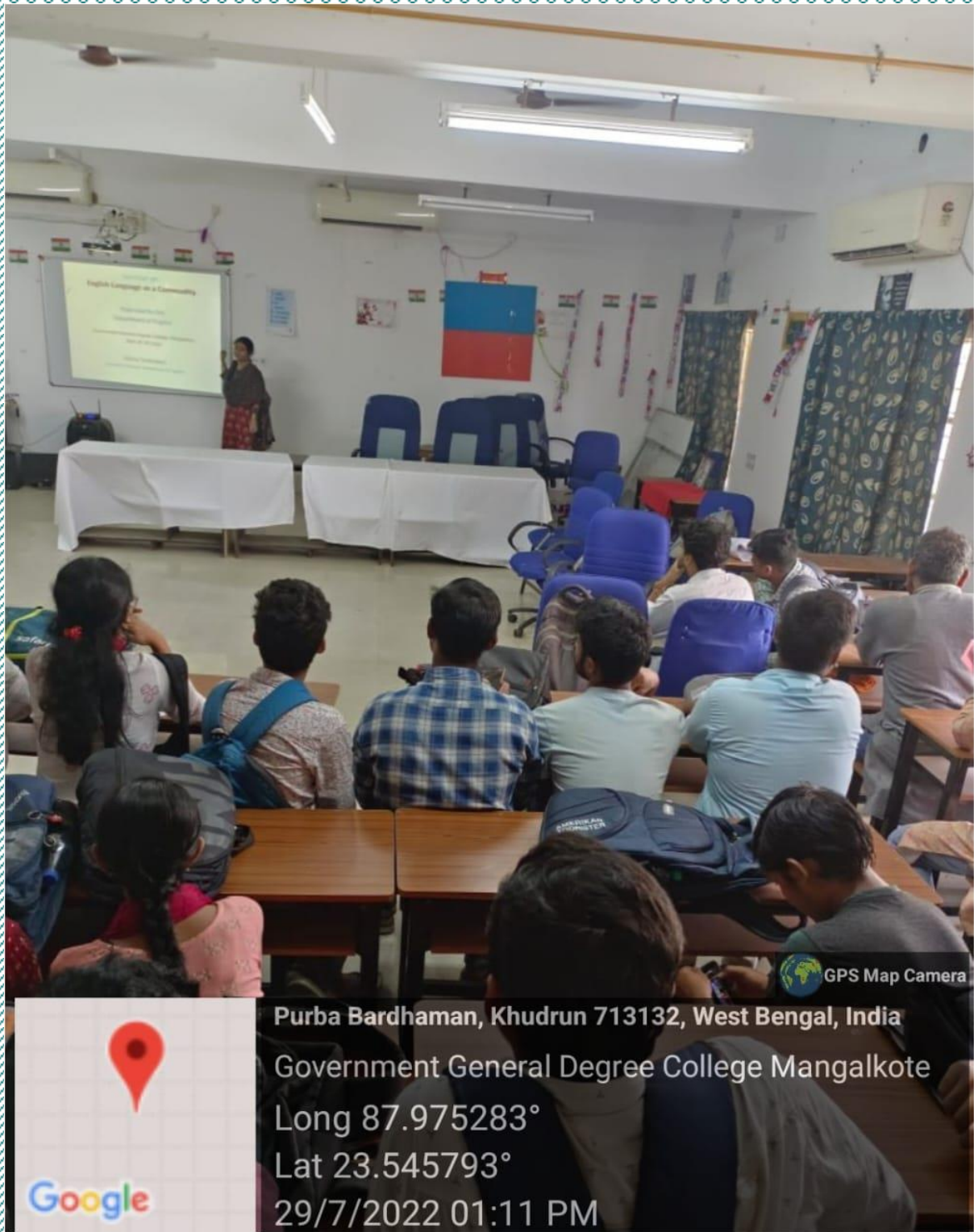
PIC.2: THE SPEAKER IN ACTION ON 29.07.22