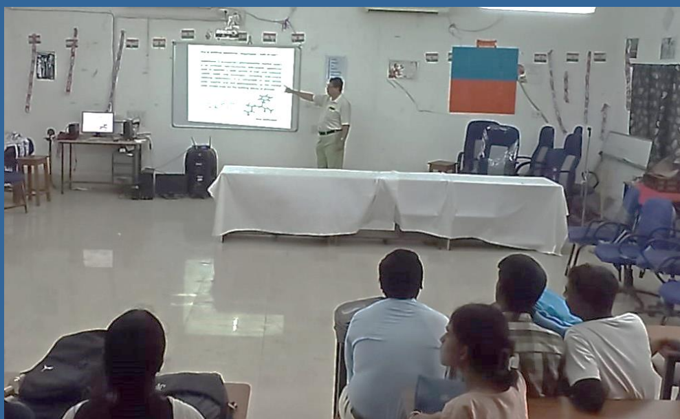
PIC.2: THE SPEAKER DELIVERING HIS LECTURE ON 03.05.19