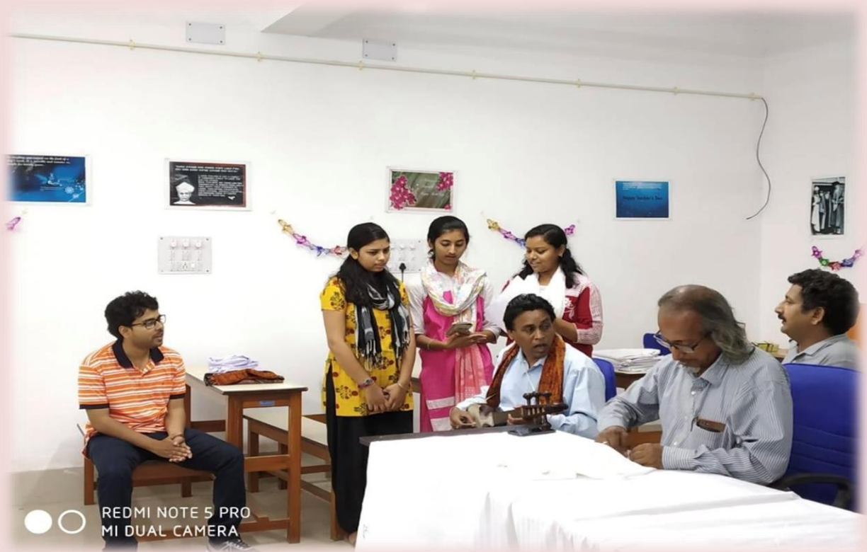
A glimpse from the innovative inaugural session of the workshop