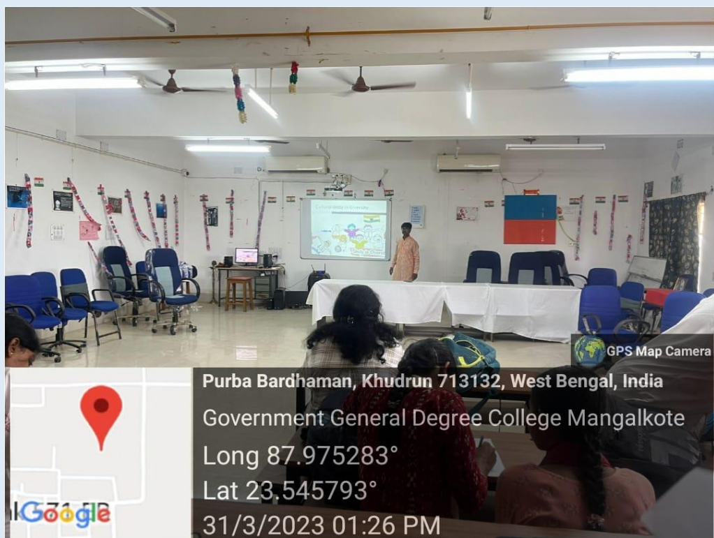
PIC.2: THE SPEAKER DELIVERING HIS LECTURE ON 31.03.23