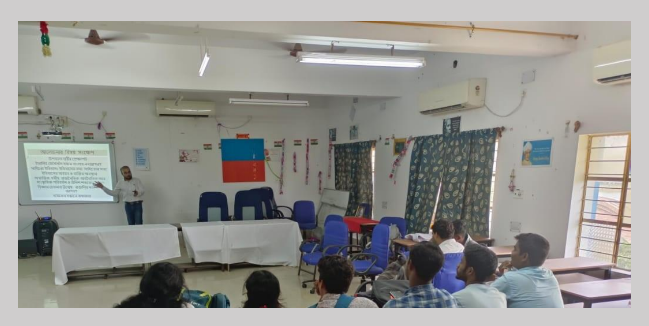
PIC.2: THE SPEAKER DELIVERING HIS LECTURE ON 04.10.18